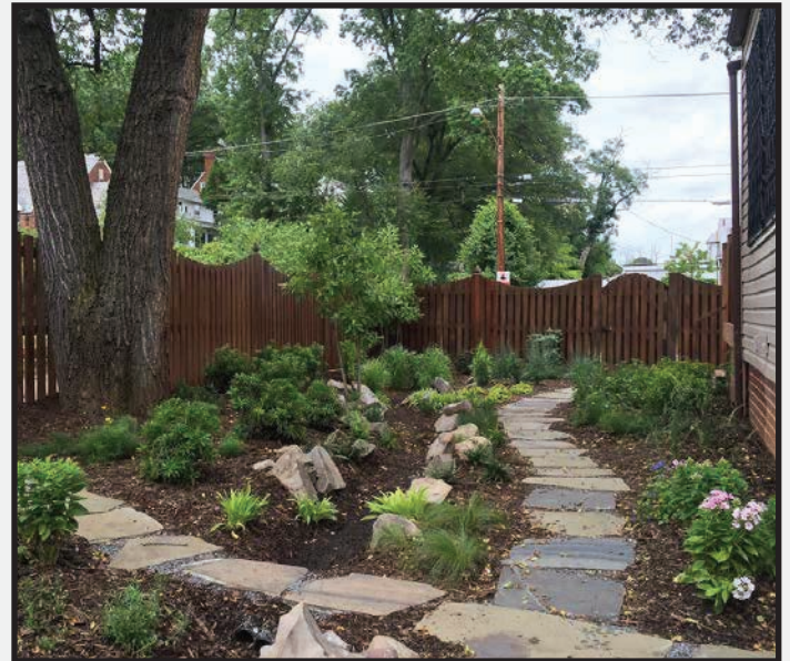
Re-Vegetation: $5 Rebate Per Square Foot.