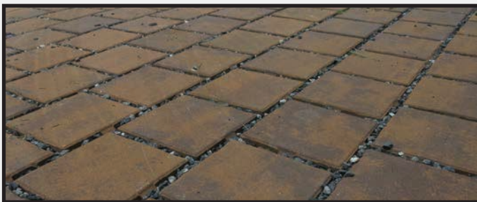
Permeable Pavers: $10 Rebate Per Square Foot